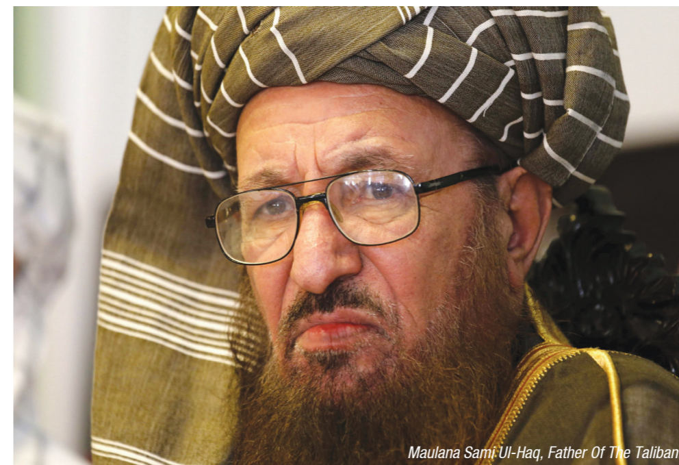
Maulana Sami Ul-Haq, Father Of The Taliban.

the 'University of Jihad' includes an impressive roster of former students such as Asim Umar, 33 Emir of AQIS, and Mullah Omar, 34 a former leader of the Taliban, who received an honorary doctorate from DUH.